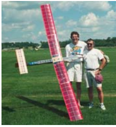
Solar Solitude, 1996

Since this early time, many model airplane builders tried to fly with solar energy, this passion becoming more and more affordable. Of course, at the beginning, the autonomy was limited to a few seconds, but it rapidly become minutes and then hours... [1].