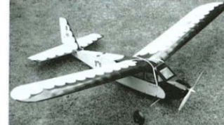
Radio Queen, 1957