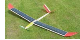
Solar Excel, 1990

Some people distinguished themselves like Dave Beck from Wisconsin, USA, who set two records in the model airplane solar category F5 open SOL of the FAI. In August 1996, his Solar Solitude flew a distance of 38.84 km in straight line and two years later, it reached the altitude of 1283 m [14,15]. But the master of the category is still Wolfgang Schaeper who holds now all the records in this category: duration (11 h 34 mn 18 s), distance in a straight line (48.31 km), gain in altitude (2065 m), speed (80.63 km/h), distance in a closed circuit (190 km) and speed in a closed circuit (62.15 km/h). He achieved these performances with Solar Excel from 1990 to 1999 in Germany [16].