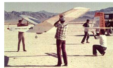
Sunrise II, 1975

Sunrise I , designed by R.J. Boucher from Astro Flight Inc. under a contract with ARPA, flew 20 minutes at an altitude of around 100 m during its inaugural flight. It had a wingspan of 9.76 m, weighed 12.25 kg and the power output of the 4096 solar cells was 450 W [2]. Scores of flight for three to four hours were made during the winter, but Sunrise I was seriously damaged when caught flying in a sand storm. Thus, an improved version, Sunrise II , was built and tested on the 12 th of September 1975. With the same wingspan, its weight was reduced to 10.21 kg and the 4480 solar cells were able this time to deliver 600 W thanks to their 14% efficiency. After many weeks of testing, this second version was also damaged due to a failure in the command and control system. Despite all, the history of solar flight was engaged and its first demonstration was done.