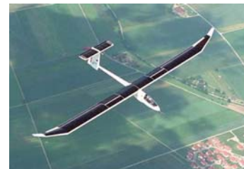
Icaré 2, 1996

In Germany, the town of Ulm organized regularly aeronautical competitions in the memory of Albrecht Berblinger, a pioneer in flying machine 200 years ago. For the 1996 event, they offered attractive prizes to develop a real, practically usable solar aircraft that should be able to stay up with at least half the solar energy a good summer day with clear sky can give [19]. This competition started activities round the earth and more than 30 announced projects, but just some arrived and only one was ready to fly for the final competition. On the 7 th of July, the motorglider Icaré 2 of Prof. Rudolf Voit-Nitschmann from Stuttgart University won the 100,000 DM price [3,20].