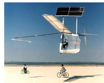
Gossamer Penguin, 1980